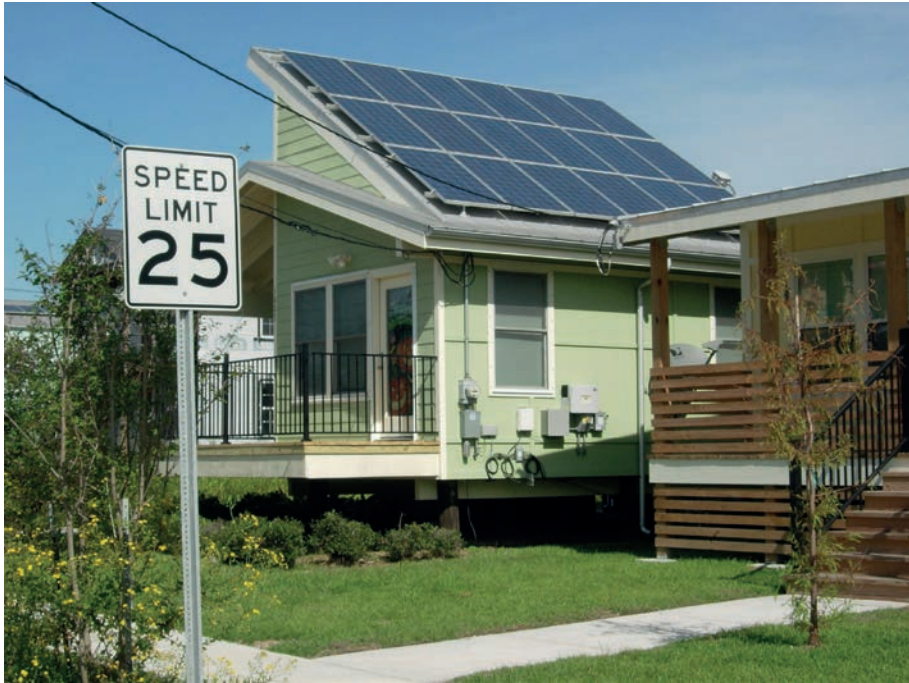
Photo 2: Houses built by the Make it Right Foundation in the Lower Ninth Ward